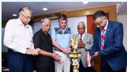
Inauguration of international workshop on Disaster management at BPBIM on 18th July 2016