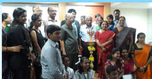
Inauguration of 2016-18 batch of PGDM at BPBIM