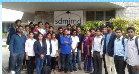
BPBIM students at SDMIMD for Convergence 31 Industry Institution coordination Workshop..