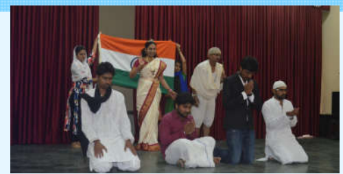
Celebration of Independence day at BPBIM