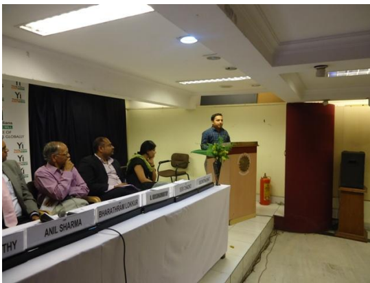
Volunteers from Volvo India Pvt. Ltd. speak