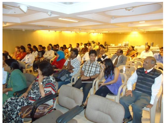
Section of audience